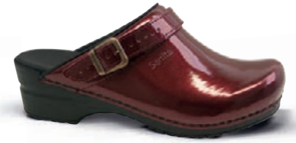
Freya // 457548 // Patent Leather 47 Bordeaux // Size 35-42