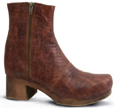
Hanus Flex // 475171 // Croco Leather 15 Cognac // Size 35-42