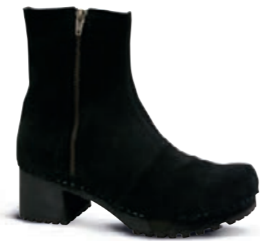
Henna Flex // 473170 // Suede 2 Black // Size 35-42