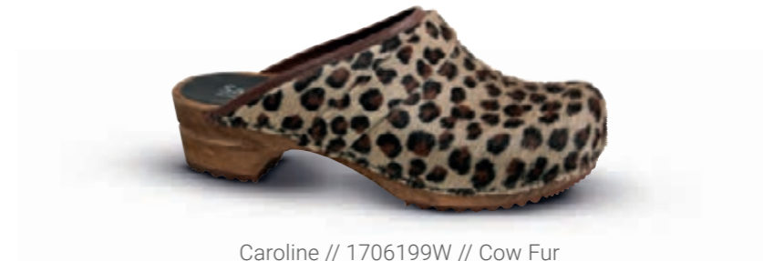
Caroline // 1706199W // Cow Fur 87 Leopard // Size 35-42