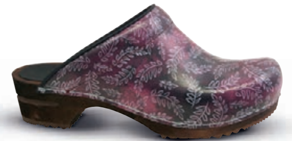
Flok // 472029 // Printed PU Leather 47 Bordeaux // Size 35-42