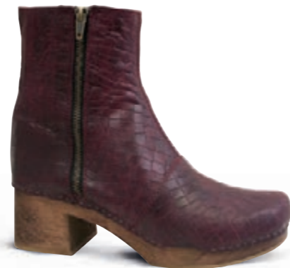
Hanus Flex // 475171 // Croco Leather 47 Bordeaux // Size 35-42