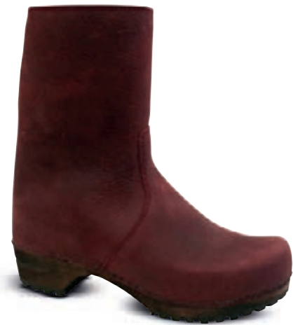
Risotto // 473222 // Oil Leather 60 Bordeaux // Size 35-42