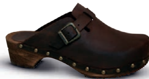
Kristel // 455205W // Oil Leather 78 Ant. Brown // Size 35-42