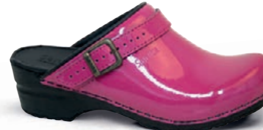
Freya // 457548 // Patent Leather 79 Fuchsia // Size 35-42