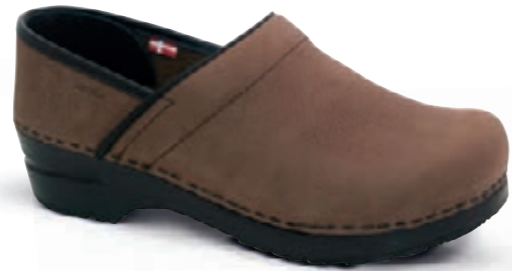
Original-Prof. Textured Oil // 450206W // WR Oil Leather 78 Ant. Brown // Size 35-43 Original-Prof. Textured Oil // 450206M // WR Oil Leather 78 Ant. Brown // Size 40-48