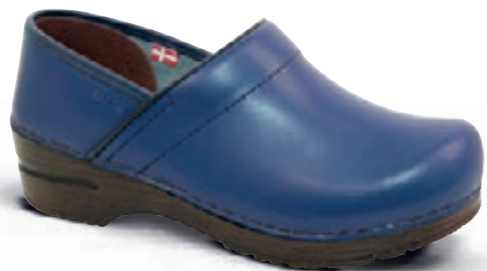
Izabella // 457006W // PU Leather 5 Blue // Size 35-43