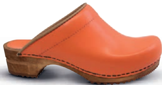
Lotte // 470009W // PU Leather 9 Orange // Size 35-42