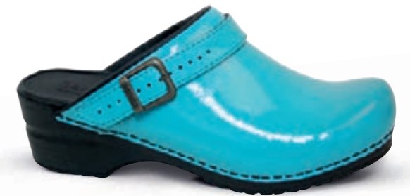
Freya // 457548 // Patent Leather 8 Turquoise // Size 35-42