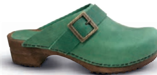
Urban // 453062 // Oil Leather 34 Mint // Size 35-42