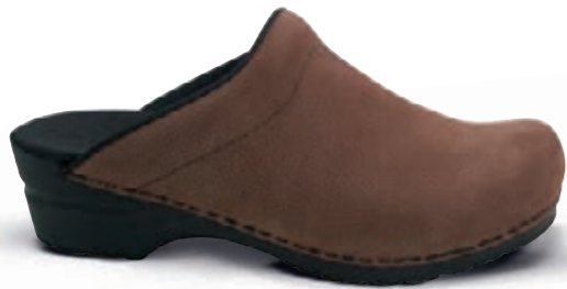
Sonja Textured Oil // 450247 // WR Oil Leather 78 Ant. Brown // Size 35-43 Karl Textured Oil // 450250 // WR Oil Leather 78 Ant. Brown // Size 40-48