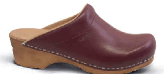
Sandra // 473047 // PU Leather 60 Bordeaux // Size 35-42