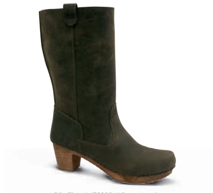
Rilo Flex // 473223 // Croco Leather 25 Green // Size 35-42