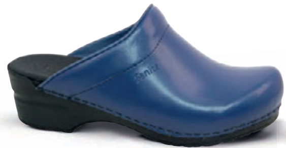
Sonja PU // 1500047 // PU Leather 55 Denim // Size 35-43