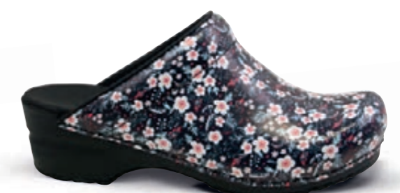
Isalena // 457618 // Printed Patent Leather 22 Black/White // Size 35-42