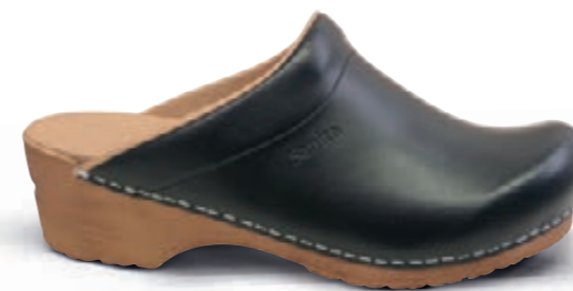
Sandra // 473047 // PU Leather 2 Black // Size 35-42