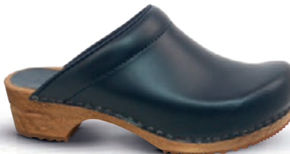
Lotte // 470009W // PU Leather 5 Blue // Size 35-42 Lars // 470009M // PU Leather 5 Blue // Size 40-48