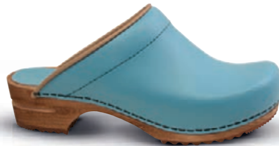
Lotte // 470009W // PU Leather 19 Teal // Size 35-42