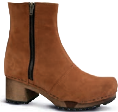
Henna Flex // 473170 // Suede 15 Cognac // Size 35-42

A wide range of boots in different heights and silhouettes; oiled nubuck, suede, full grain and embossed leather types.