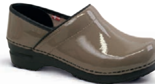
Original-Prof. Patent // 457406W Patent Leather // 175 Taupe // Size 35-42