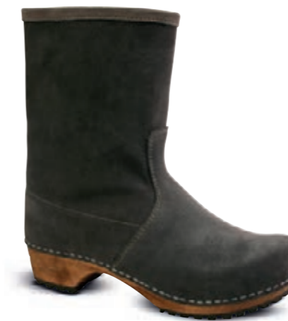
Hulola // 473110 // Suede 69 Grey // Size 35-42