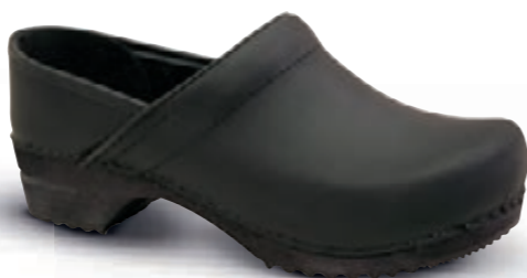
Julie // 1201005W // Oil Leather 2 Black // Size 35-42 Jamie // 1201005M // Oil Leather 2 Black // Size 40-48