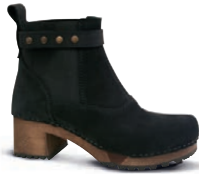
Hilma Flex // 475110 // Suede 2 Black // Size 35-42