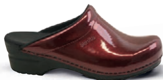
Sonja Patent // 450447 // Patent Leather 47 Bordeaux // Size 35-43