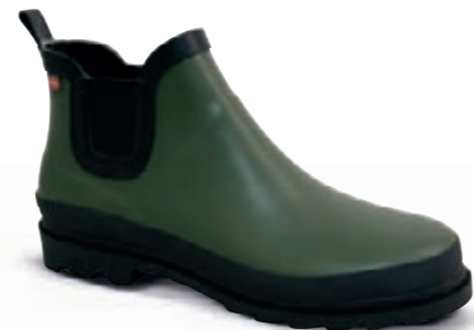
Felicia Welly // 467987 // Natural Rubber 64 Olive // Size 36-42