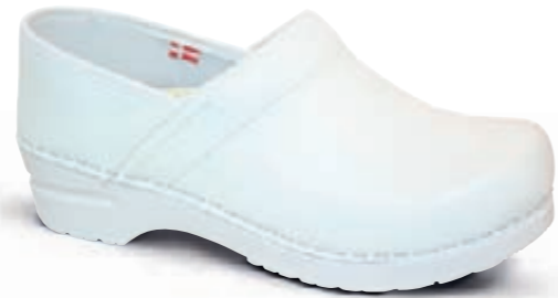
Original-Prof. PU // 1500006W PU Leather // 1 White // Size 35-43 Original-Prof. PU // 1500006M PU Leather // 1 White // Size 40-48