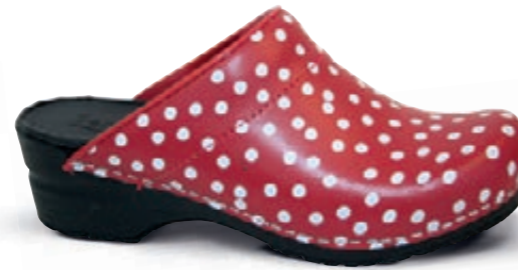
Fenja // 457048 // Printed PU Leather 4 Red // Size 35-42