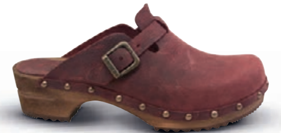
Kristel // 455205W // Oil Leather 60 Bordeaux // Size 35-42