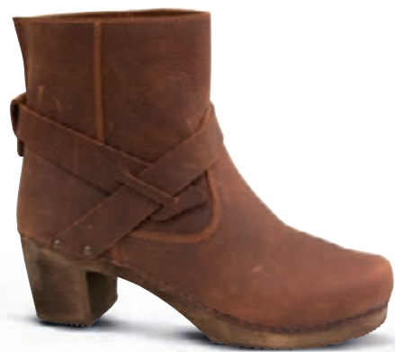
Risi // 475220 // Oil Leather 15 Cognac // Size 35-42