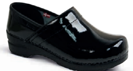
Original-Prof. Patent // 457406W Patent Leather // 2 Black // Size 35-42