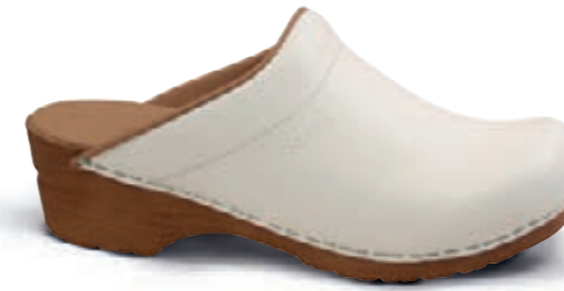
Sandra // 473047 // PU Leather 1 White // Size 35-42