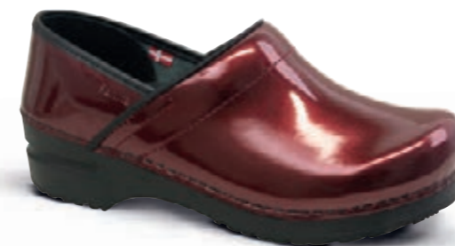
Original-Prof. Patent // 457406W Patent Leather // 47 Bordeaux // Size 35-42