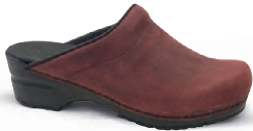
Sonja Textured Oil // 450247 // WR Oil Leather 60 Bordeaux // Size 35-43

Sanita Oil nubuck is thick cow leather with a buffed and oiled surface. The oil treatment creates a natural and mat look and highlight the dept in the colours. The leather has the characteristic cow grain structure and is treated to be water resistant.