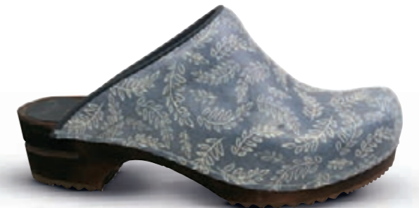
Flok // 472029 // Printed PU Leather 20 Grey // Size 35-42