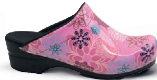
Inalo // 475647 // Printed Patent Leather 79 Fuchsia //35-42