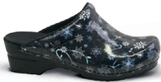
Inalo // 475647 // Printed Patent Leather 72 Blue //35-42

Patent coated leather is split leather (suede) with shiny lacquered Polyurethane foil covering the surface. A strong and water proof leather – easy to clean.