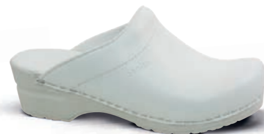
Sonja PU // 1500047 // PU Leather 1 White // Size 35-43 Sonja PU Wide // 1500147 // PU Leather 1 White // Size 35-43 Karl PU // 1500050 // PU Leather 1 White // Size 40-48