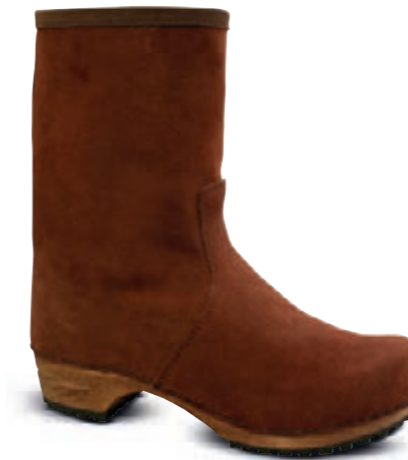
Hulola // 473110 // Suede 15 Cognac // Size 35-42

Sanita classic clog boot on a low heeled wooden sole with non slip rubber profile.