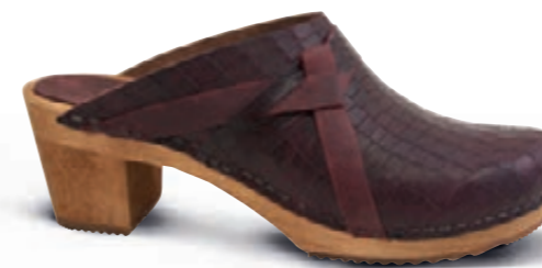
Manuella // 472200 Croco Leather // 47 Bordeaux // Size 35-42