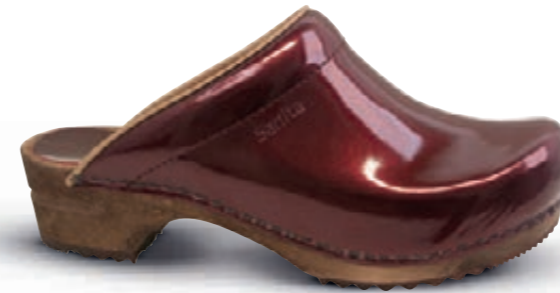
Classic Patent // 457012 // Metallic Patent 47 Bordeaux // Size 35-42