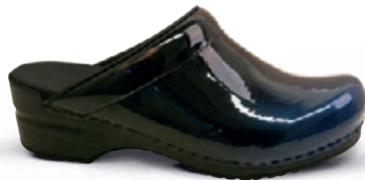
Original // 1990045 // Patent Leather 5 Blue // Size 35-43