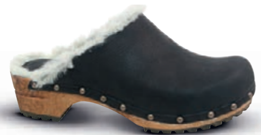
Hese // 450401 // Yak Waxy Nubuck 2 Black // Size 35-42