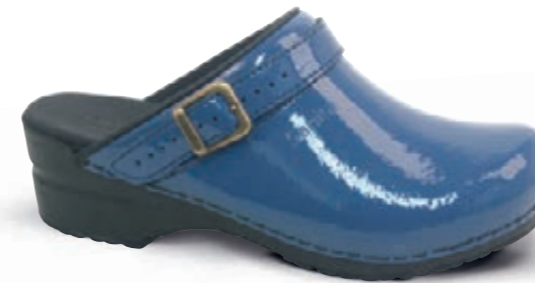
Freya // 457548 // Patent Leather 5 Denim // Size 35-42