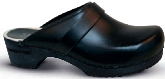
Rita // 1500199W // PU Leather 2 Black // Size 35-42 Ralph // 1500199M // PU Leather 2 Black // Size 40-48

Natural wooden soles and cleanable materials. Leather which is perfectly moulded to the clog last will maintain the shape; Coated surface – easy to clean!