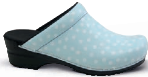
Fenja // 457048 // Printed PU Leather 72 Sky // Size 35-42