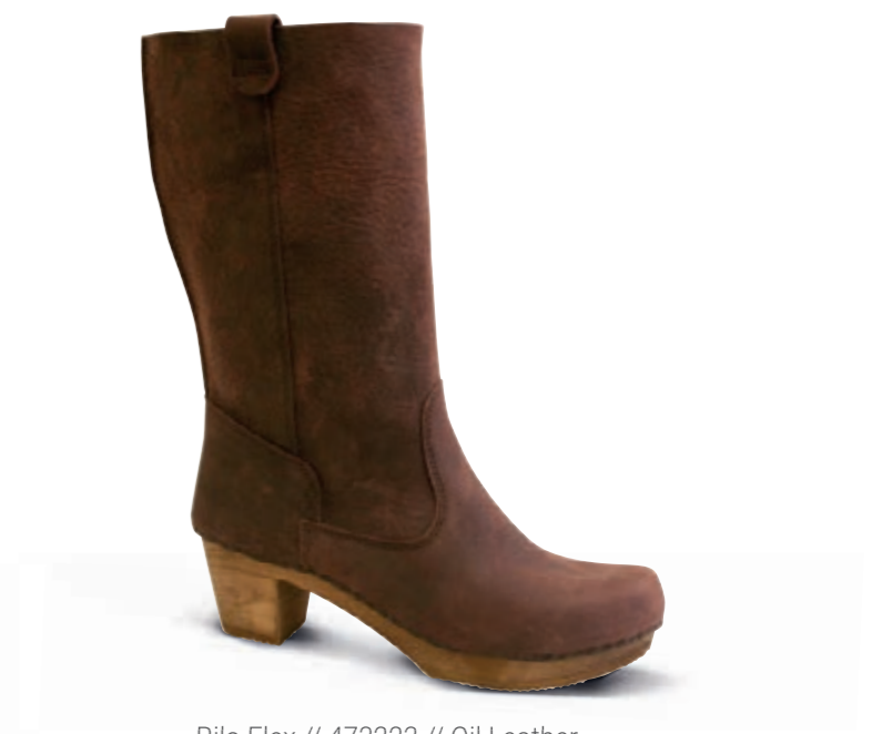
Rilo Flex // 473223 // Oil Leather 15 Cognac // Size 35-42