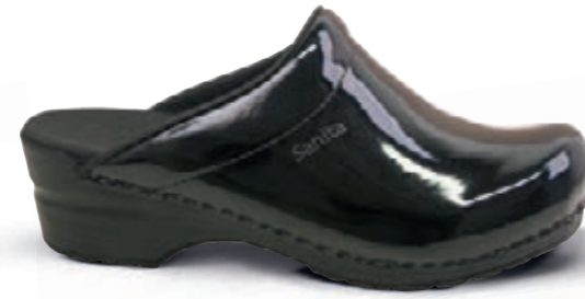
Original // 1990049 // Patent Leather 2 Black // Size 35-43