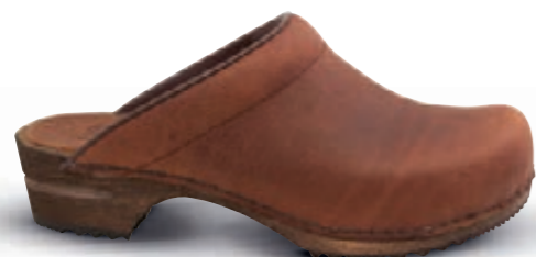
Chrissy // 1200009W // Oil Leather 3 Chestnut // Size 35-42 Christian // 1200009M // Oil Leather 3 Chestnut // Size 40-48

Oil nubuck is thick cow leather with a buffed and oiled surface. The oil treatment creates a natural mat look and high light the dept in the colours. In addition, the leather become soft and flexible; the oil finish also makes the leather water repellent.