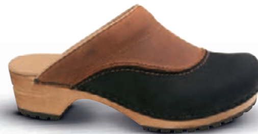
Naia // 475200 // Oil Leather 2 Black/Cognac // Size 35-42