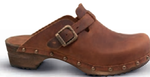
Kristel // 455205W // Oil Leather 3 Chestnut // Size 35-42