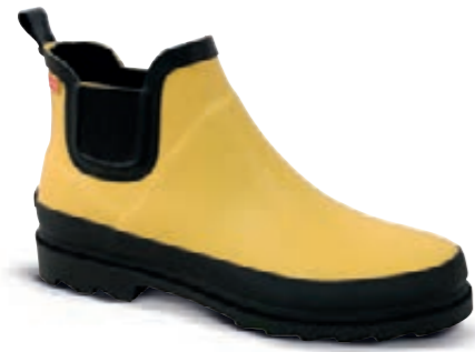
Felicia Welly // 467987 // Natural Rubber 7 Yellow // Size 36-42

Danish design, classical Scandinavian look and feel in our range of wellies Our Chelsea boot is made of NATURAL rubber which is MAX flexible and durable. on rainy days Sanita wellies will keep your feet dry and warm.