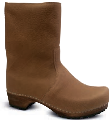
Risotto // 473222 // Yak Leather 14 Beige // Size 35-42