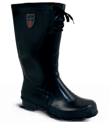
Hunting Boot // 538665 // PVC Rubber 2 Black // Size 34-46