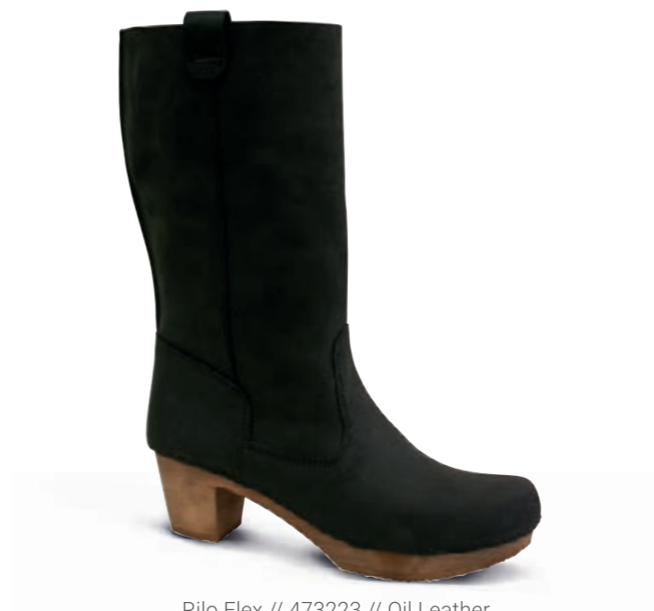
Rilo Flex // 473223 // Oil Leather 2 Black // Size 35-42