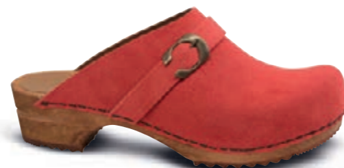
Hedi // 457190 // Suede 48 Coral // Size 35-42

Traditional clog style in SUEDE; selected colours matching the Autumn/Winter 2021 palette. 5 cm high platform sole with heel carving; the iconic Sanita wood style.