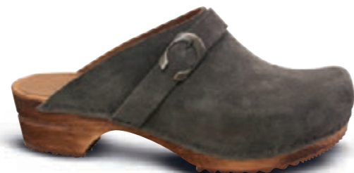
Hedi // 457190 // Suede 69 Grey // Size 35-42