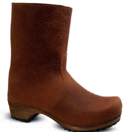
Risotto // 473222 // Oil Leather 15 Cognac // Size 35-42