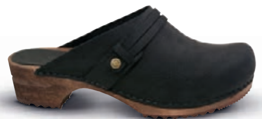
Ursuna // 474260 // WR Oil Leather // 2 Black // Size 35-42