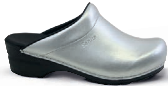
Sonja PU // 1500047 // PU Leather 16 Silver // Size 35-43

The iconic ORIGINAL CLOG STYLE was patented by Sanita and launched in 1988. The original outsole is constructed with an invisible frame stabilizing the shape and securing the staples. An anatomical shaped and soft padded footbed provide max comfort to the foot cushioning every step.