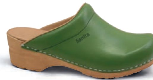
Sandra // 473047 // PU Leather 25 Green // Size 35-42