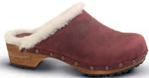
Hese // 450401 // Yak Waxy Nubuck 60 Bordeaux // Size 35-42

Oil nubuck from cow and YAK lined with real lamb fur all around to keep the feet warm.