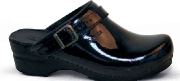
Freya // 457548 // Patent Leather 2 Black // Size 35-42