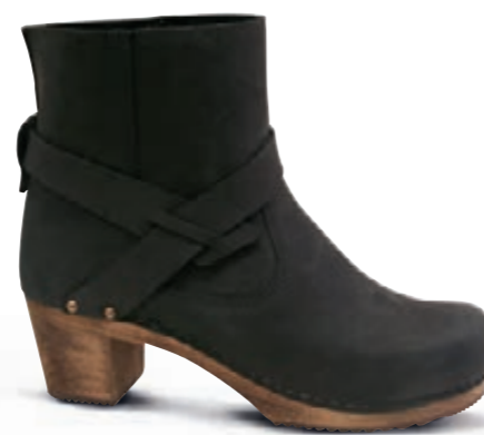
Risi // 475220 // Oil Leather 2 Black // Size 35-42