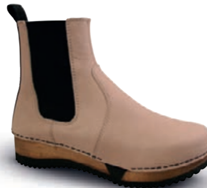
Rumi Flex // 475321 // Leather 24 Beige // Size 35-42