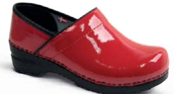
Original-Prof. Patent // 457406W Patent Leather // 4 Red // Size 35-42