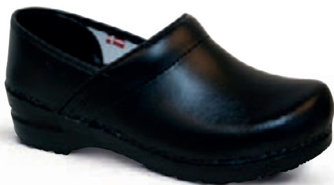
Original-Prof. PU // 1500006W PU Leather // 2 Black // Size 35-43 Original-Prof. PU // 1500006M PU Leather // 2 Black // Size 40-48