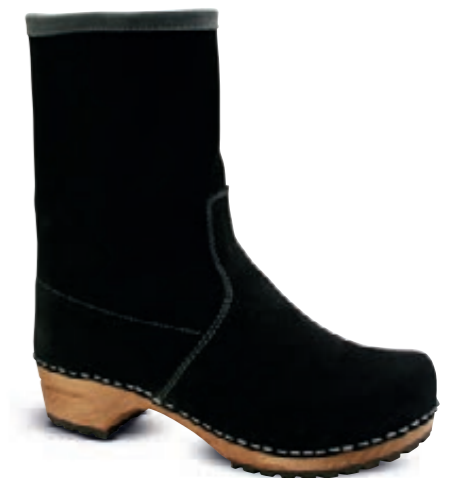
Hulola // 473110 // Suede 2 Black/Grey // Size 35-42