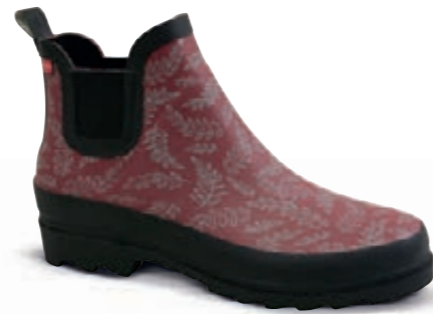
Felicia Welly // 467987 // Natural Rubber 47 Bordeaux // Size 36-42