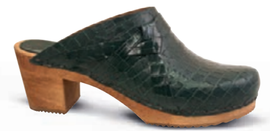
Manuella // 472200 Croco Leather // 25 Green // Size 35-42