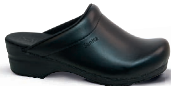
Sonja PU // 1500047 // PU Leather 2 Black // Size 35-43 Sonja PU Wide // 1500147 // PU Leather 2 Black // Size 35-43 Karl PU // 1500050 // PU Leather 2 Black // Size 40-48