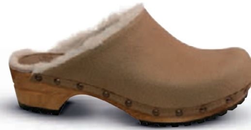
Hese // 450401 // Yak Waxy Nubuck 14 Beige // Size 35-42