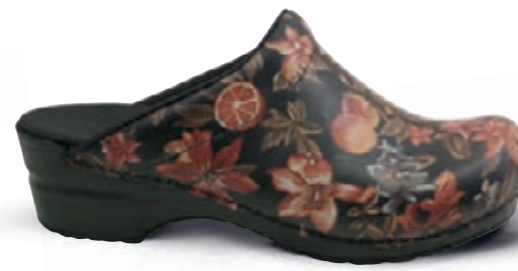
Koina // 7450027 // Printed Leather 9 Orange // Size 35-42