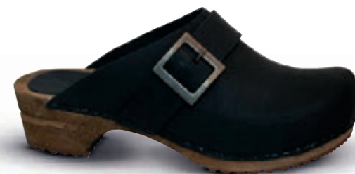
Urban // 453062 // Oil Leather 2 Black // Size 35-42