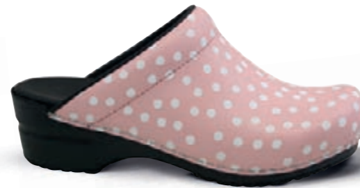
Fenja // 457048 // Printed PU Leather 65 Rose // Size 35-42