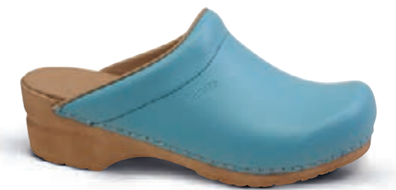
Sandra // 473047 // PU Leather 19 Teal // Size 35-42