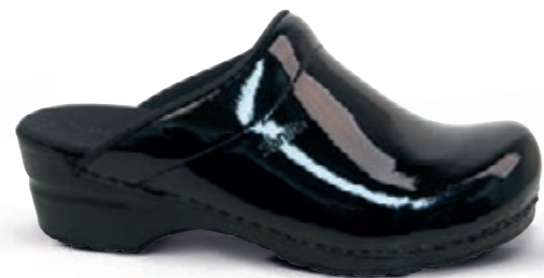
Sonja Patent // 450447 // Patent Leather 2 Black // Size 35-43