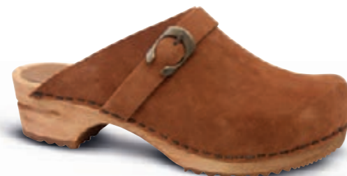
Hedi // 457190 // Suede 15 Cognac // Size 35-42