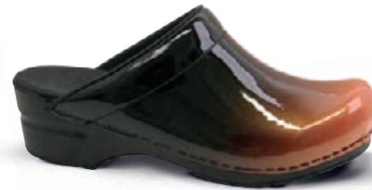
Original // 1990045 // Patent Leather 9 Orange // Size 35-43