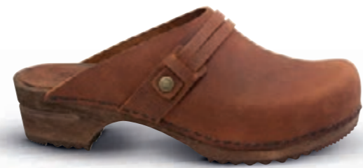
Ursuna // 474260 // WR Oil Leather // 3 Chestnut // Size 35-42