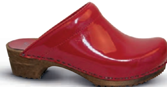
Classic Patent // 457012 // Patent Leather 4 Red // Size 35-42