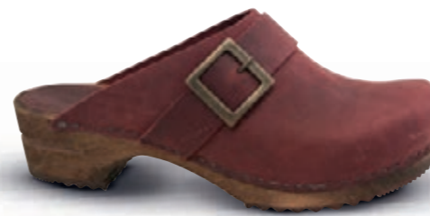
Urban // 453062 // Oil Leather 60 Bordeaux // Size 35-42