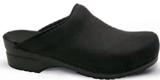
Sonja Textured Oil // 450247 // WR Oil Leather 2 Black // Size 35-43 Karl Textured Oil // 450250 // WR Oil Leather 2 Black // Size 40-48