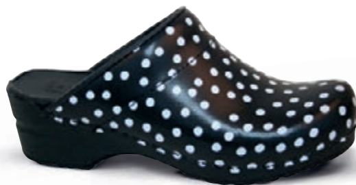
Fenja // 457048 // Printed PU Leather 2 Black // Size 35-42