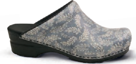
Isalena // 457618 // Printed Patent Leather 20 Grey // Size 35-42