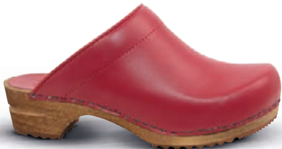
Lotte // 470009W // PU Leather 4 Red // Size 35-42