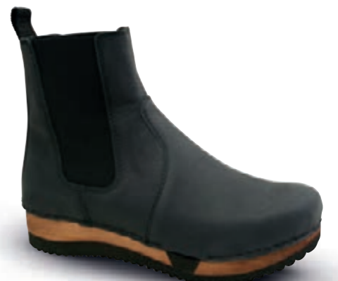
Rumi Flex // 475321 // Leather 2 Black // Size 35-42