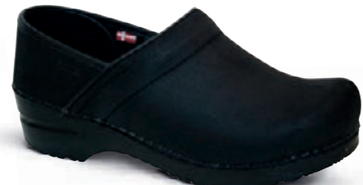
Original-Prof. Textured Oil // 450206W // WR Oil Leather 2 Black // Size 35-43 Original-Prof. Textured Oil // 450206M // WR Oil Leather 2 Black // Size 40-48