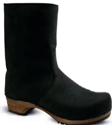
Risotto // 473222 // Oil Leather 2 Black // Size 35-42