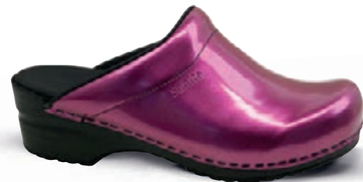
Original // 1990049 // Patent Leather 32 Purple // Size 35-43