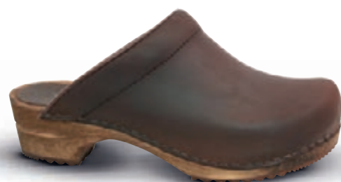
Chrissy // 1200009W // Oil Leather 78 Ant. Brown // Size 35-42 Christian // 1200009M // Oil Leather 78 Ant. Brown // Size 40-48