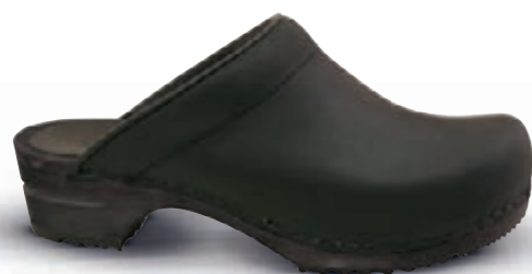
Chrissy // 1200009W // Oil Leather 2 Black // Size 35-42 Christian // 1200009M // Oil Leather 2 Black // Size 40-48