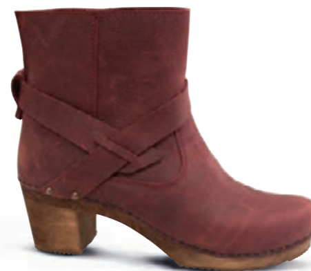
Risi // 475220 // Oil Leather 60 Bordeaux // Size 35-42