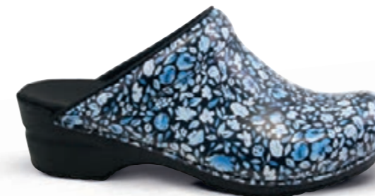
Isalena // 457618 // Printed Patent Leather 55 Black/Blue // Size 35-42