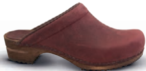
Chrissy // 1200009W // Oil Leather 60 Bordeaux // Size 35-42