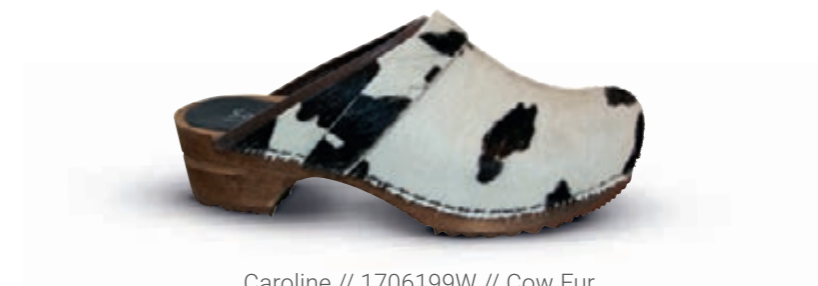
Caroline // 1706199W // Cow Fur 3 Brown Cow // Size 35-42 Casper // 1706199M // Cow Fur 3 Brown Cow // Size 40-48