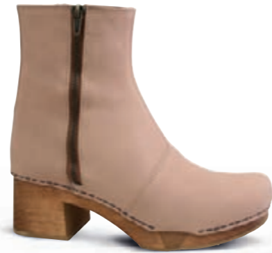
Hanus Flex // 475171 // Leather 24 Beige // Size 35-42