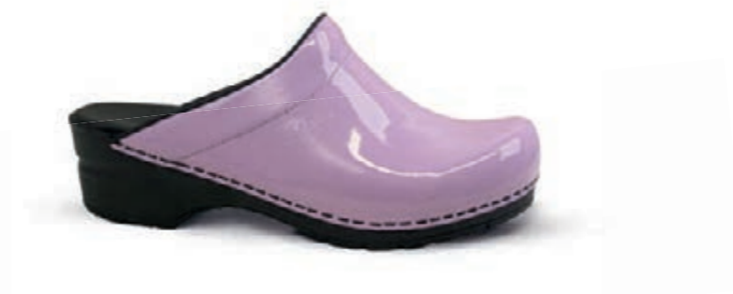
Sonja Patent // 450447 // Patent Leather 32 Purple // Size 35-43