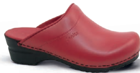
Sonja PU // 1500047 // PU Leather 4 Red // Size 35-43