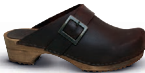
Urban // 453062 // Oil Leather 78 Ant. Brown // Size 35-42