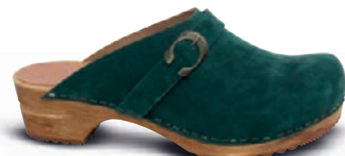
Hedi // 457190 // Suede 25 Dark Green // Size 35-42