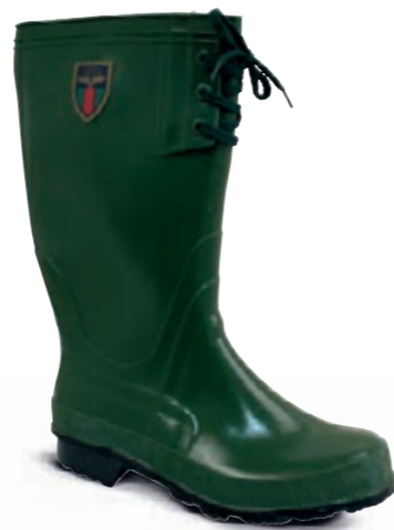
Hunting Boot // 538665 // PVC Rubber 25 Green // Size 34-46