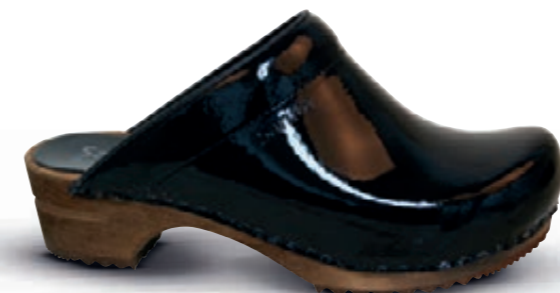
Classic Patent // 457012 // Patent Leather 2 Black // Size 35-42