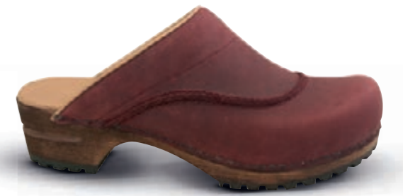
Naia // 475200 // Oil Leather 60 Bordeaux // Size 35-42