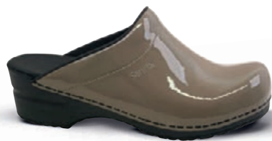
Sonja Patent // 450447 // Patent Leather 175 Taupe // Size 35-43