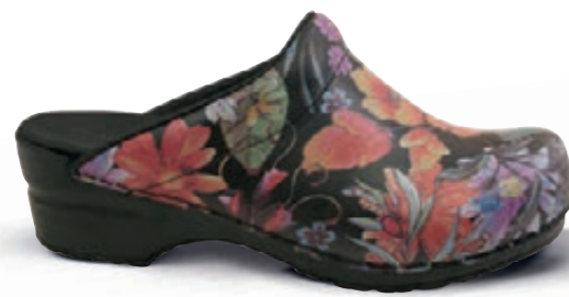
Koina // 7450027 // Printed Leather 90 Multicolor // Size 35-42