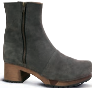
Henna Flex // 473170 // Suede 69 Grey // Size 35-42