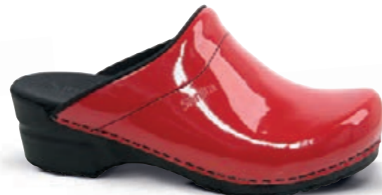
Sonja Patent // 450447 // Patent Leather 4 Red // Size 35-43