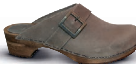
Urban // 453062 // Oil Leather 20 Grey // Size 35-42