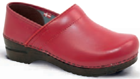
Izabella // 457006W // PU Leather 4 Red // Size 35-43

PU coated leather is split leather (suede) with a Polyurethane foil covering the surface. The strong and uniform PU foil is strong and durable and makes the shoe suitable for work. The surface of the leather can easily be cleaned; even with disinfecting liquid.