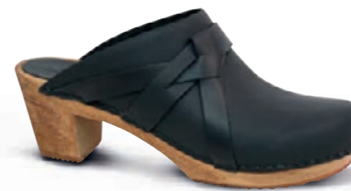
Manuella // 472200 Oil Leather // 2 Black // Size 35-42