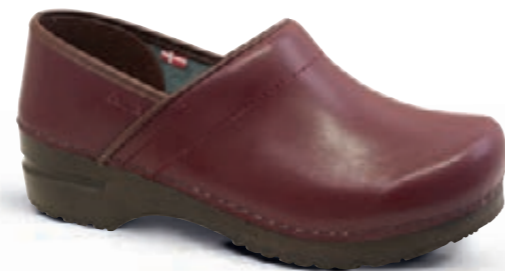
Izabella // 457006W // PU Leather 60 Bordeaux // Size 35-43