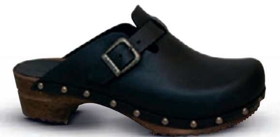
Kristel // 455205W // Oil Leather 2 Black // Size 35-42