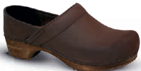
Julie // 1201005W // Oil Leather 78 Ant. Brown // Size 35-42 Jamie // 1201005M // Oil Leather 78 Ant. Brown // Size 40-48