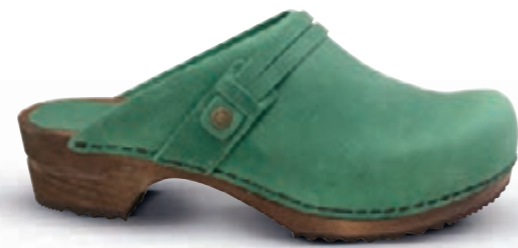
Ursuna // 474260 // WR Oil Leather // 34 Mint // Size 35-42