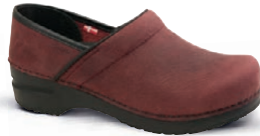
Original-Prof. Textured Oil // 450206W // WR Oil Leather 60 Bordeaux // Size 35-43