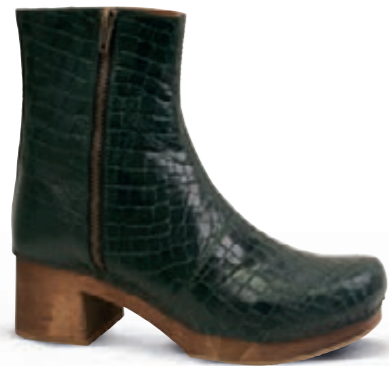
Hanus Flex // 475171 // Croco Leather 25 Green // Size 35-42