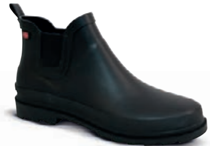
Felicia Welly // 467987 // Natural Rubber 2 Black // Size 36-42