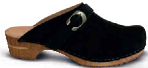
Hedi // 457190 // Suede 2 Black // Size 35-42