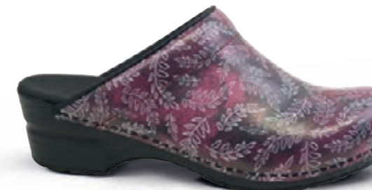
Isalena // 457618 // Printed Patent Leather 47 Bordeaux // Size 35-42